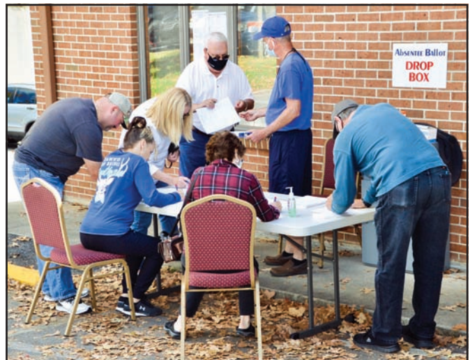
Towns County poll workers are directing voters to fill out a small form upon arrival for early in-person voting at the Elections Board Office.